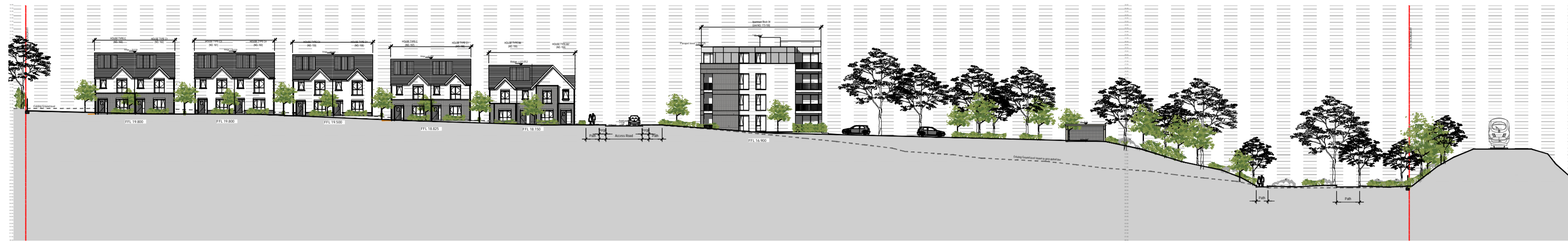
01 Site Context Elevation F-F Scale: 1:500