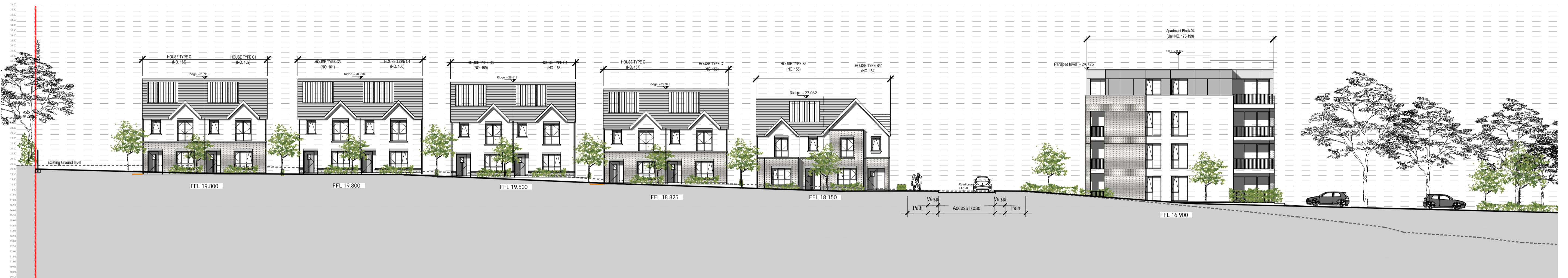
02 Site Context Elevation F-F Part 1 Scale: 1:200